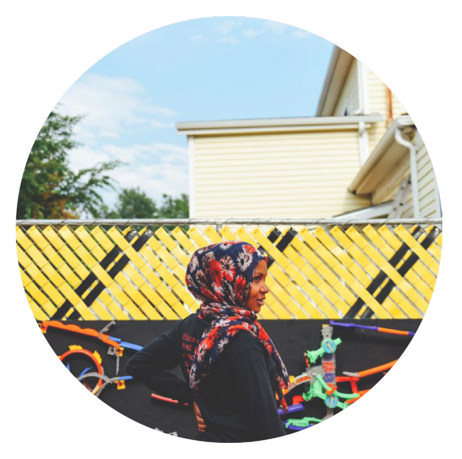
Woman in front of This Machine Has a Soul art installation